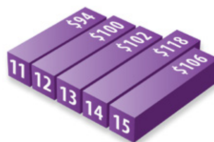
Operating Cash Flow (in millions)